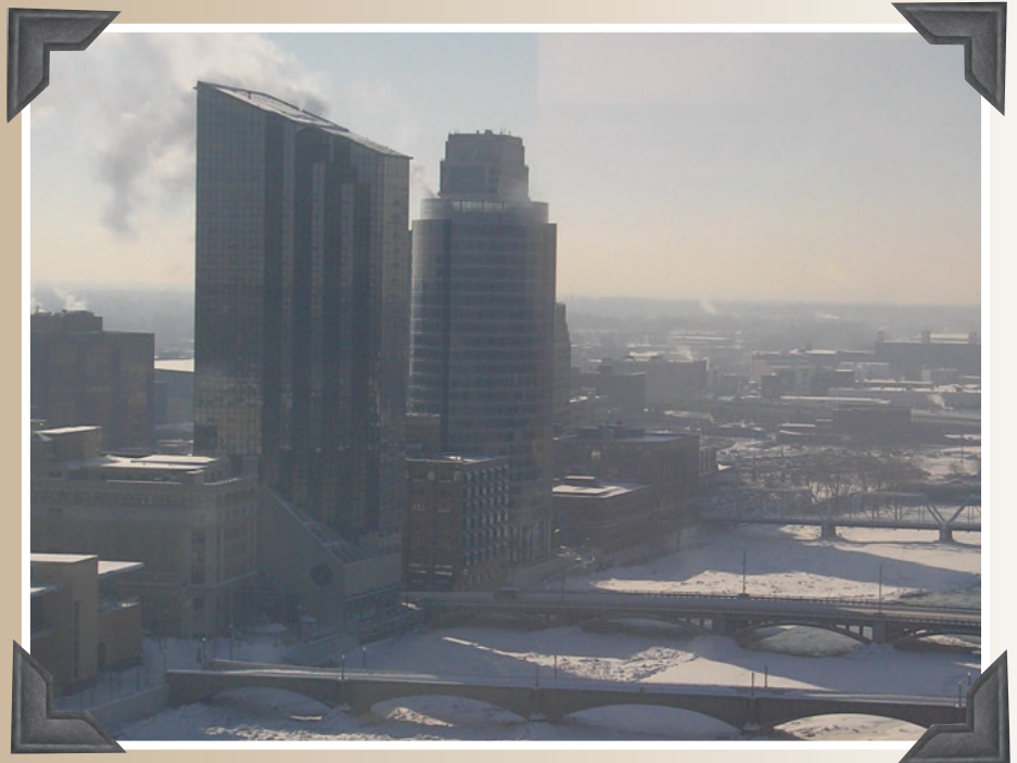
View from Varnum, Riddering, Schmidt & Howlett, LLP in Grand Rapids, Michigan.