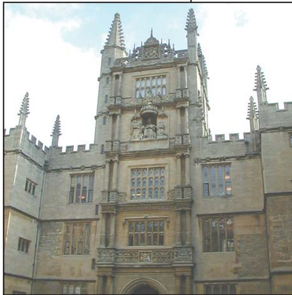
Located at the entrance of the Bodleian Library, the Tower of the Five Orders depicts the five orders of classical architecture: Doric, Tuscan, Ionic, Corinthian and Composite.