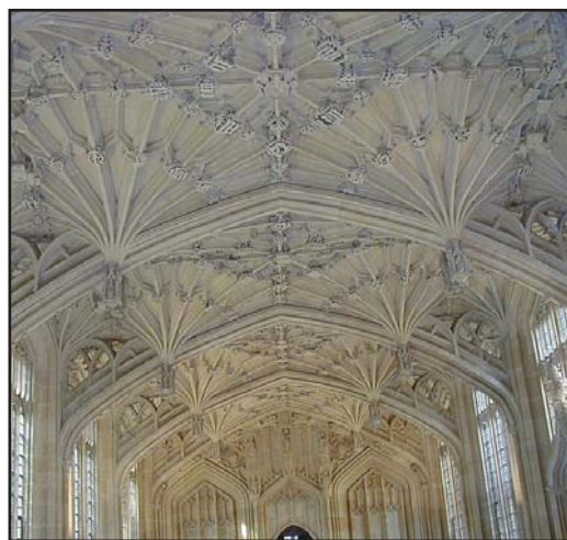
The Divinity School, which was part of the original Bodleian Library, features an elaborate fan-vaulted ceiling.