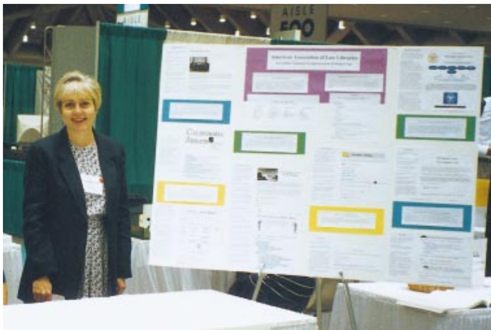
The author and one of her easels, in the Activities Area of the Exhibit Hall at the Annual meeting in Baltimore in July.