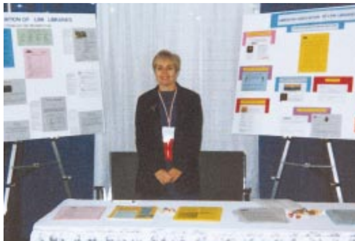
The author and the ITIWG exhibit at NCSL in Philadelphia in August. "They also serve who only stand and wait."

Our next dilemma was how to publicize the work that we had done. There have been some articles in AALL Spectrum , but we wanted to get the word out to more people—Webmasters, technology administrators, judges, legislators, etc. We decided that one effort would be to exhibit at three conferences, hoping that we had chosen good forums to help spread the word.