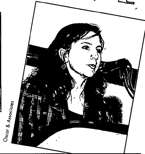
Oscar & Associates