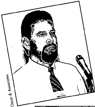
Oscar & Associates