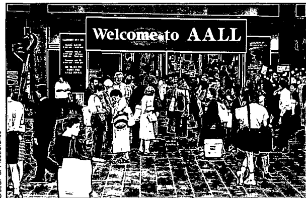
Oscar & Associates