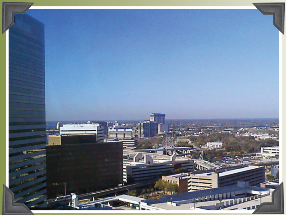
View from the U.S. Court of Appeals 11th Circuit Library in Jacksonville, Florida. The AT&T skyscraper is at left with St. John's River in the distance.