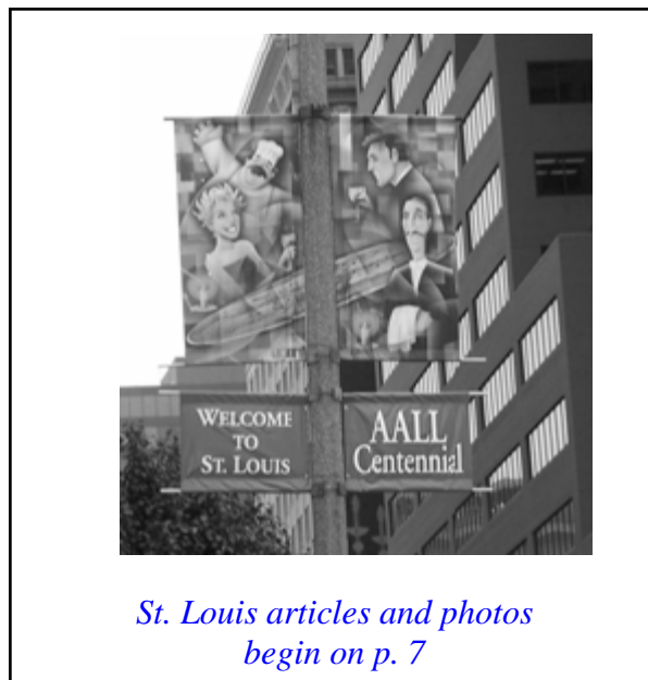
St. Louis articles and photos begin on p. 7